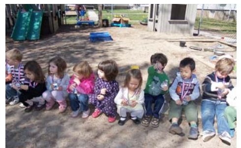
Step-a-thon medals ceremony