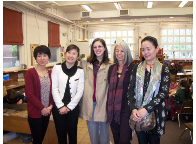
Visitors from China

We have also been actively involved in giving back to the larger community. More than fifty Yale students did a practicum at Calvin Hill as part of their coursework for three of my child development classes this year. We have had many visitors from other schools and countries (most recently China) as well as other interested professional groups. The Calvin Hill staff, who are, as you know, experienced and knowledgeable about block building, just conducted a workshop for New Haven teachers that was very well received. Attendees were excited not only by the content of the workshop, but by the Center's space and by the materials that make our philosophy, curriculum, and vision visible. We have been collaborators in New Haven's Early Childhood Council and a voice in demonstrating what high-quality, nurturing early childhood education should and must be.